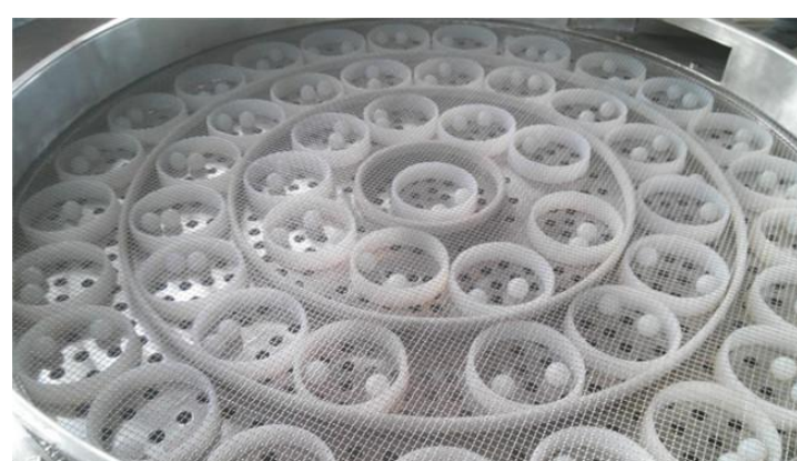
Screen frame group