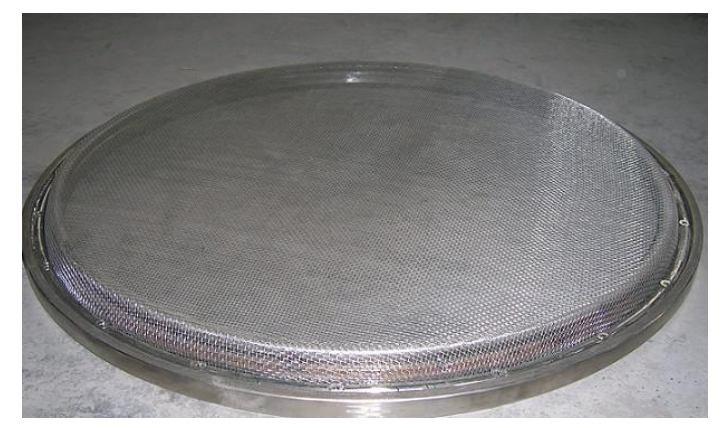
Wear resisting screen

Round vibrating screen has a totally enclosed structure with high performance, low noise, free of dust and liquid free-running property.